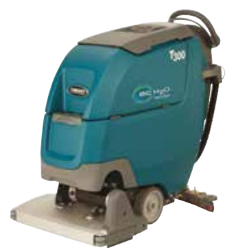
Dual Cylindrical: 500 mm