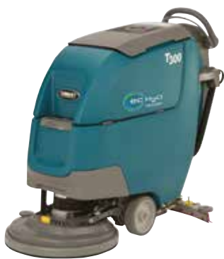
Single disk: 430 mm & 500 mm

The T300 scrubber-dryer provides multiple scrub-decks to fit your cleaning requirements and optimise cleaning performance.