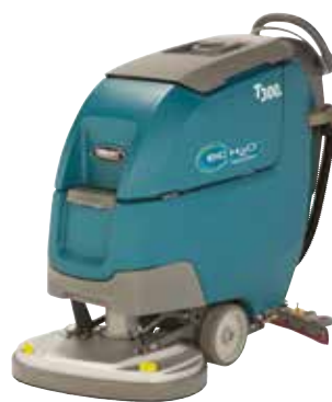
Dual disk: 600 mm