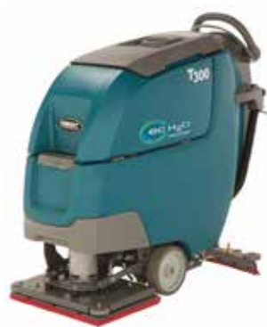
Orbital: 500 mm