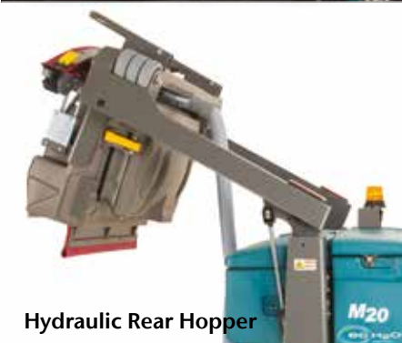
Hydraulic Rear Hopper