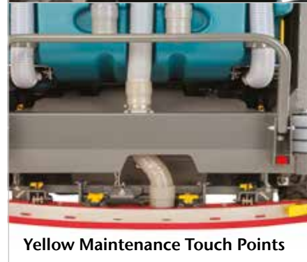
Yellow Maintenance Touch Points

▶ Easy-to-identify yellow maintenance touch points help save time and money in routine maintenance activity.