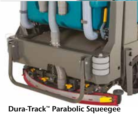
Dura-Track™ Parabolic Squeegee

Overhead guard protects operators from falling objects.